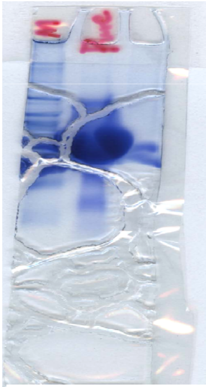
mDF 04-03-08 tmelt